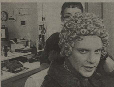
Has anyone seen my career?

1. Slick and Gordie - Who these people are, or where they can be found we don't know but the nicknames "Slick" and "Gordie" appeared at the top of all the ballots. Something to do with Sundays, holidays, and 10:01 PM perhaps.