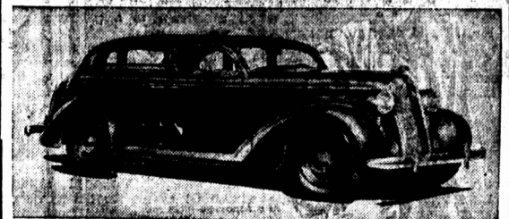
Plymouth De Luxe 4-Door Touring Sedan

See the 1936 Models Chrysler and Plymouths