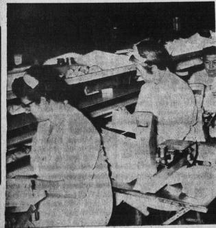
4—FILLETS PACKED IN ONE TO FIVE LB. LOTS