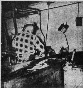
2—SKINNING MACHINES ARE FED