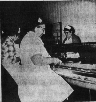
8—FILLET IS CHECKED FOR CLEANLINESS

Canadian-Australian Oil Company, a Canadian-owned firm, has entered the intensified search for oil in New South Wales, Australia.