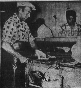
1—FILLETING A FLOUNDER

BRASILIA (AP)—Former premier Francisco Brossado da Rocha suffered a stroke Tuesday and is in serious condition, a high government source said. The 52-year-old law professor quit as premier of Brazil Sept. 13 during a political crisis.