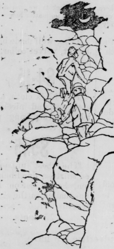
But they kept at it until they reached the level ground.

Among the numerous sailboats moving over the rippling surface of the Hudson, opposite the upper part of the city of New York, on that pleasant evening in May, was a roomy craft containing three persons. One was the master, while the others were a heavily armed United States marshal and his deputy.