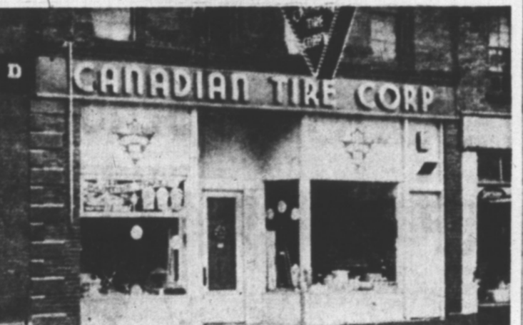
CANADIAN TIRE CORP.

Your Most Pleasant Shopping Memories of P. E. I. Will Be Your Visit To . . .