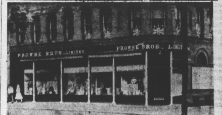
PROWSE BROS. LTD.

Taylor's JEWELLERS LTD 121 Grafton St. Dial 4253