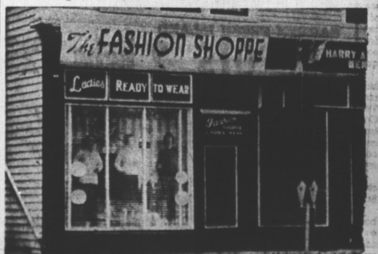
THE FASHION SHOPPE