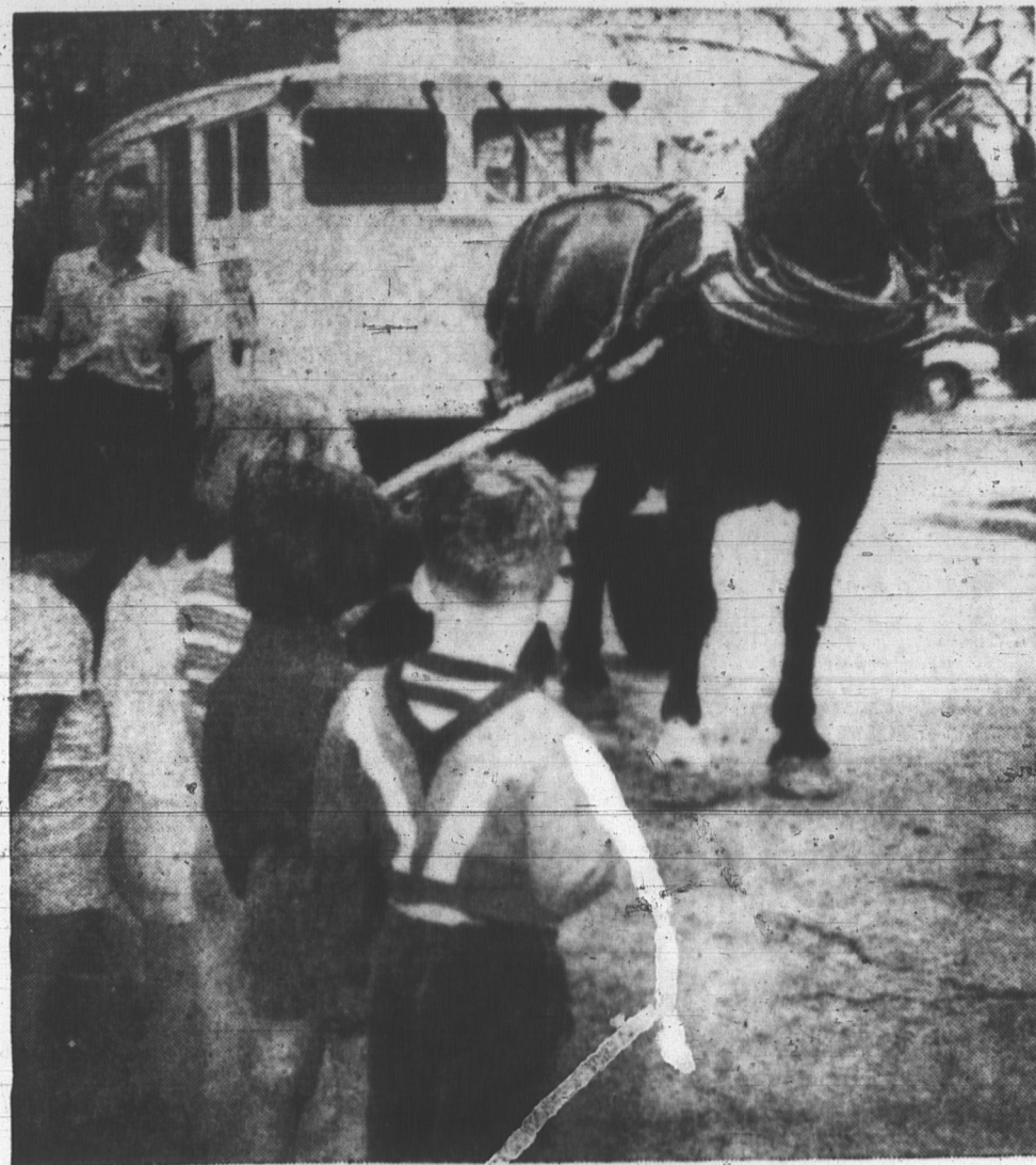
ISN'T PROGRESS WONDERFUL

The horse is making a come-back in Kitchener, Ont., in the age of the machine. A Kitchener dairy has replaced motorized milk vans with the horse-drawn type on half of its 30 milk routes because they feel horses provide faster and more efficient delivery.