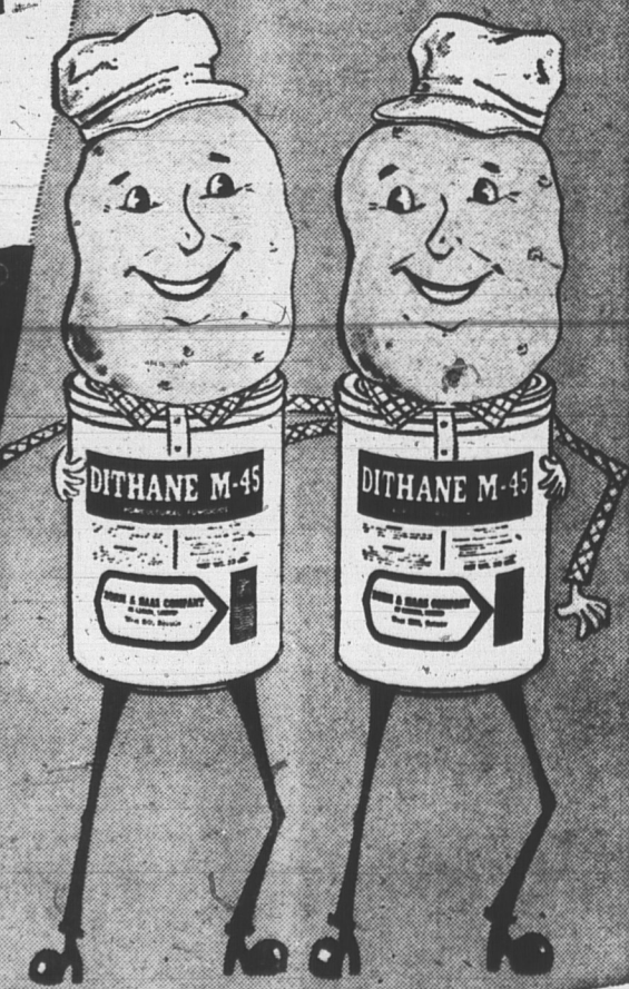
DITHANE is a trademark. Reg. Canadian Pat. Off. and in principal foreign countries.