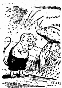
He wondered if it was good to eat.

Mrs. Possum was fretful. She had reason to be. She was carrying around through the Green Forest a family of ten children, and you will admit that any mother carrying ten children has a right to be fretful. Some of them were riding on her back. Some of them were in her big pocket where she had carried all of them when they were helpless babies. They were three months old now and a lively lot they were. Now Mrs. Possum was a good mother. Were it not so she would not have carried that lively little crew wherever she went. Even good mothers do get tired and fretful and out of patience. At three months of age the little Possums were no longer babies. It was about time for them to be starting out in the Great World for themselves. Mother would miss them. Of course. How could she help but miss ten such lively