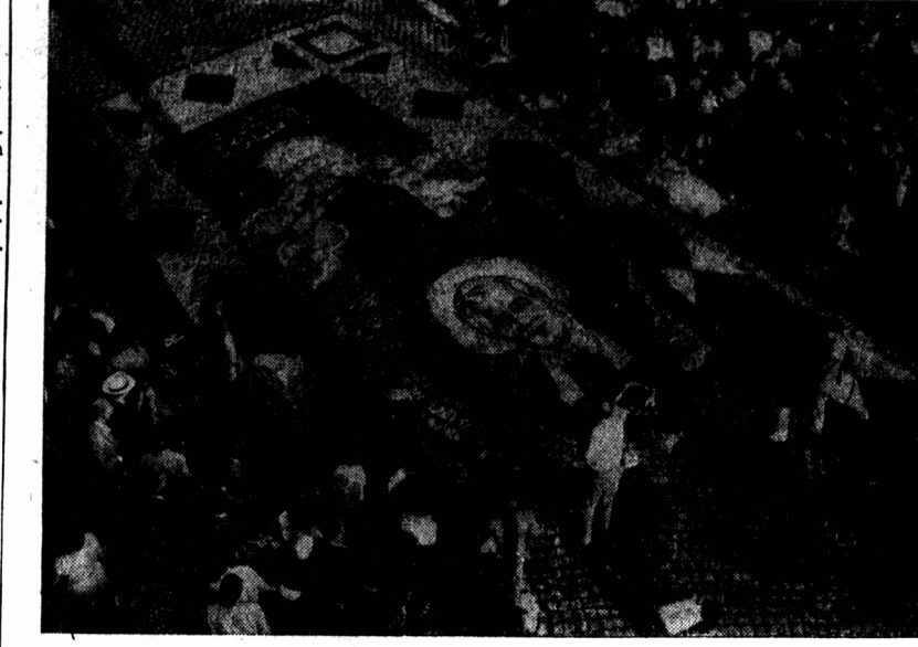
Citizens of Genzano, Italy, put the finishing touches to a flower petal painting of the recently canonized Pope Pius X in observance of a 176-year-old religious festival. Three tons of fragrant petals were laid in design, paving a street leading to the St. Mary of the Top church. The petals, gathered in the spring, were assorted according to color and stored in damp caves. Some 50,000 people took part in the festival.