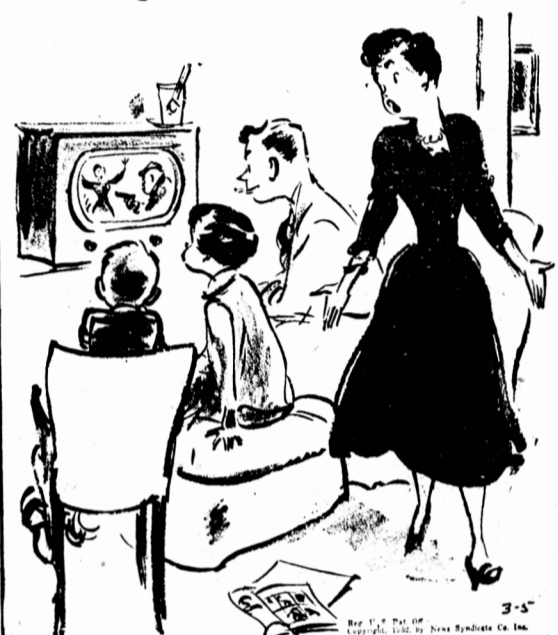
"Just the usual family story. Murder, bank robbery—I've seen it lots of times before."