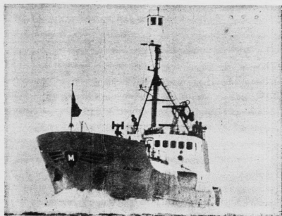
M/T "BLUE WATERS"

We are proud to be locating in Georgetown and to offer the Fishing Industry all types of steel fishing vessels from Canada's most modern trawler building yard. Quality and speed of delivery will be substantially improved by the indoor construction methods to be adopted in our new plant.