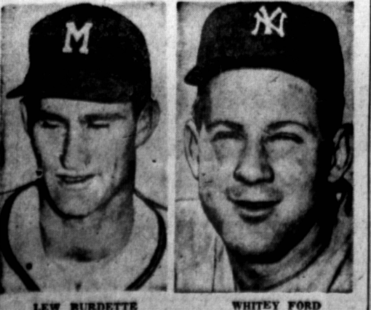
LEW BURDETTE WHITEY FORD STARTING PITCHERS Pictured above are the starting pitchers for today's World Series game at County Stadium. Manager of the Braves has nominated Lew Burdette, who