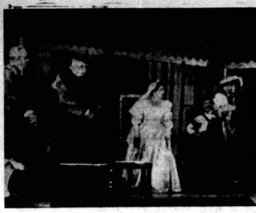
KATHARINA, the Shrew, (centre), stands agast as her husband Petruchio (right of centre) announces his intention to remove his new bride from her father's home immediately.