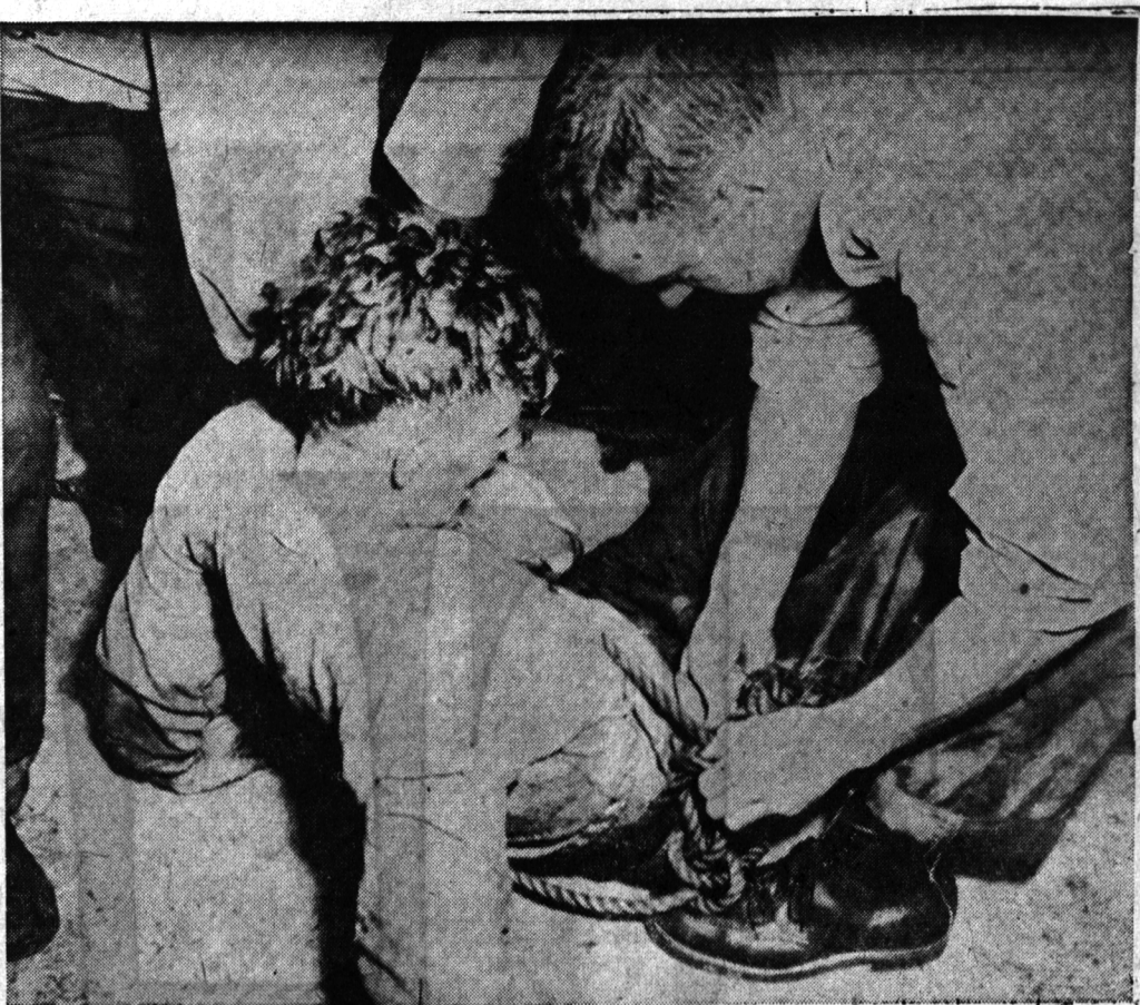
LONG ORDEAL OVER

SUMMERSIDE — An Elmsdale man pleading guilty to a charge of being intoxicated in a public place was fined $20 and costs in Magistrate's Court here Thursday morning. An earlier charge of having care and control of a motor vehicle while intoxicated was dropped, when testimony revealed that the car in which the accused had been found was the property of another person. A Summerside man charged with driving while intoxicated was remanded for trial Tuesday.