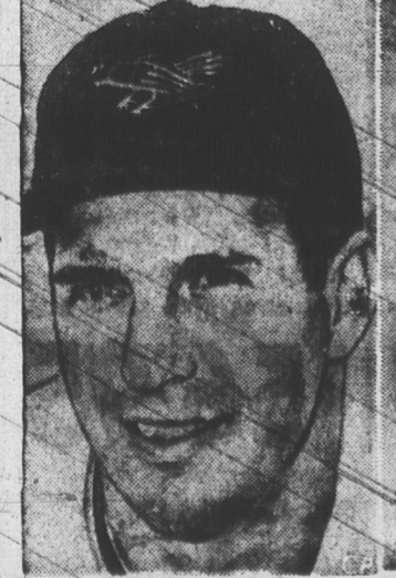
BALTIMORE THIRD BASEMAN