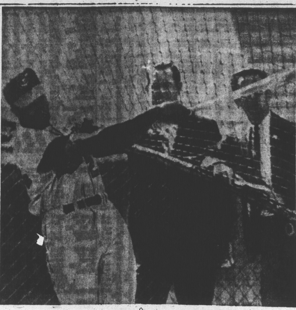
ORIOLES' HITTING STAR POWDERS ONE