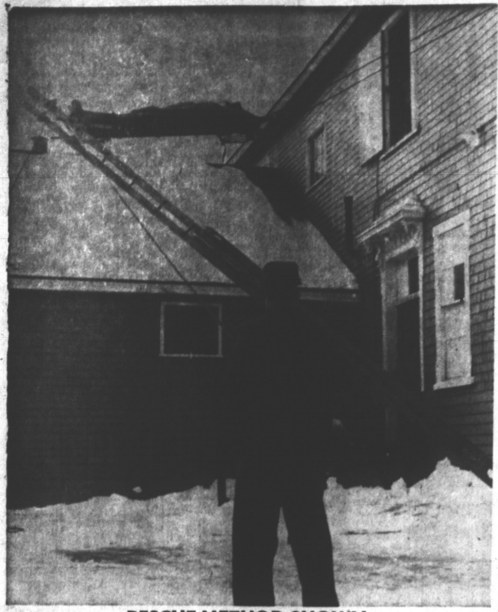
RESCUE METHOD SHOWN

The first of three methods of rescue is performed as part of a militia rescue demonstration held in Montague yesterday. Using this method the victim is strapped to a stretcher and using a ladder as a hinge he is easily and comfortably lowered to the ground.