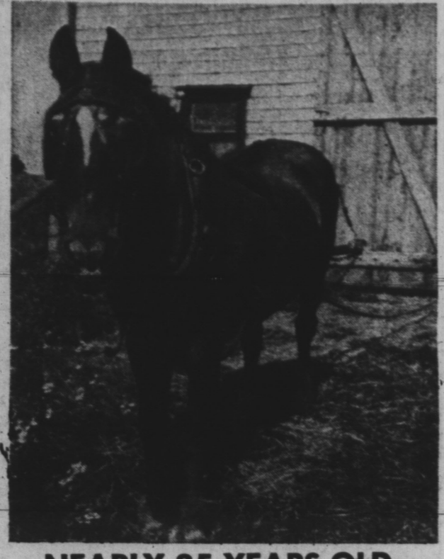
NEARLY 35 YEARS OLD