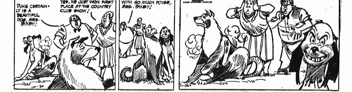
By Cliff McBride