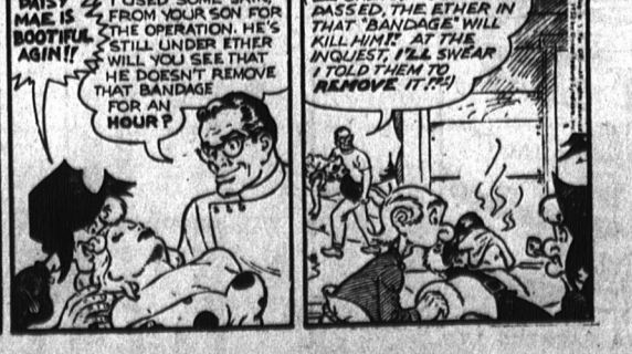
By L.L. Business