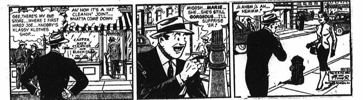
By Joe Palooka