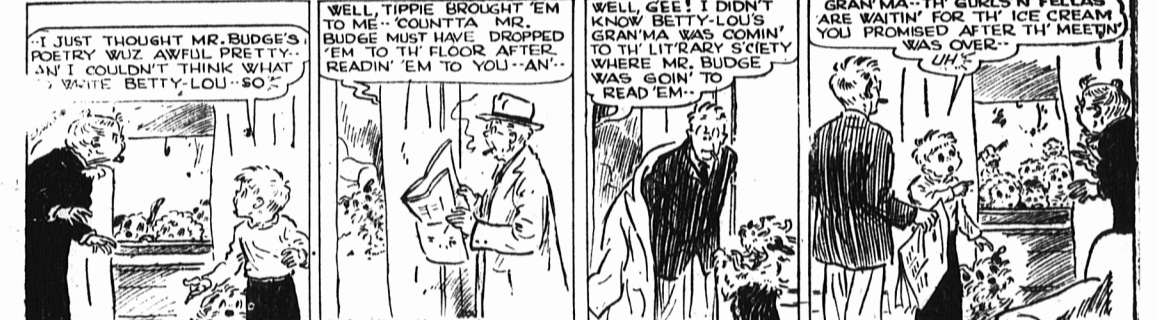
By Tippy and Cap Stubs