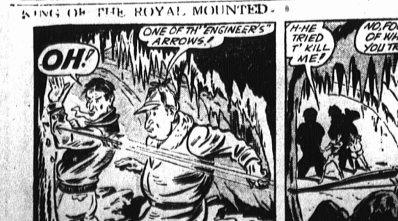
By King of the Royal Mounted

PAINT A ROOM WITH Kem-Tone FOR THE PRICE OF TWO PAIRS OF NYLONS