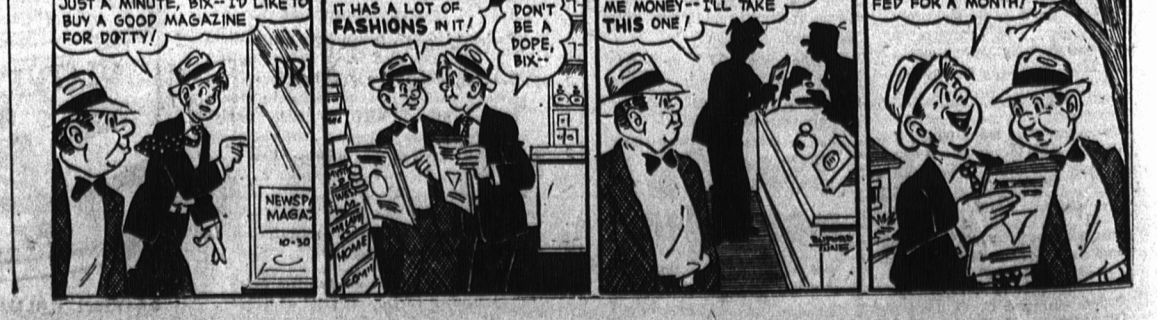
By Dotty Drizzle