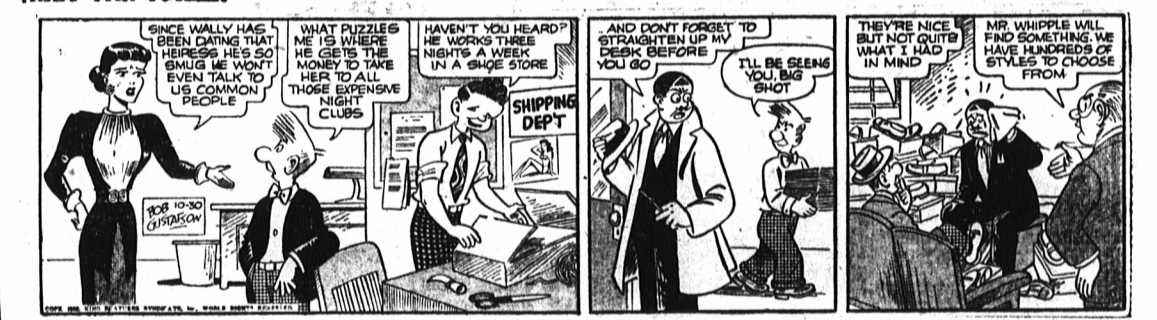
By Tilly the Toiler