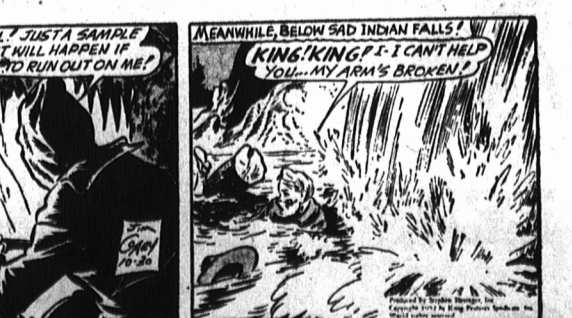
By King of the Royal Mounted