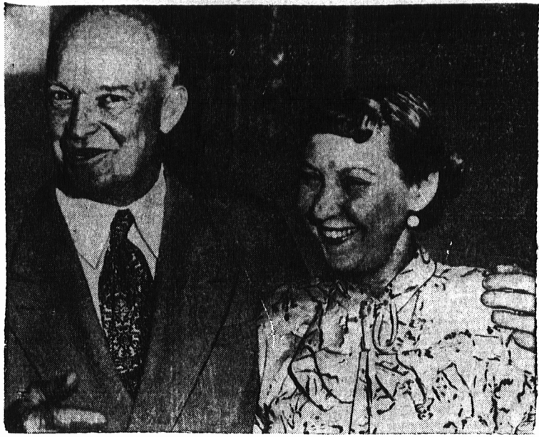
As soon as Gen. Eisenhower was informed he had been elected as Republican presidential candidate he sought his wife "Mamie" and appeared on the balcony of their Chicago hotel to acknowledge the cheers of the crowd. But after a few minutes, Gen. Ike admitted he was tired and disappeared. The Republicans, sure they have a winner in the November presidential elections, continued their demonstrations of acclaim.