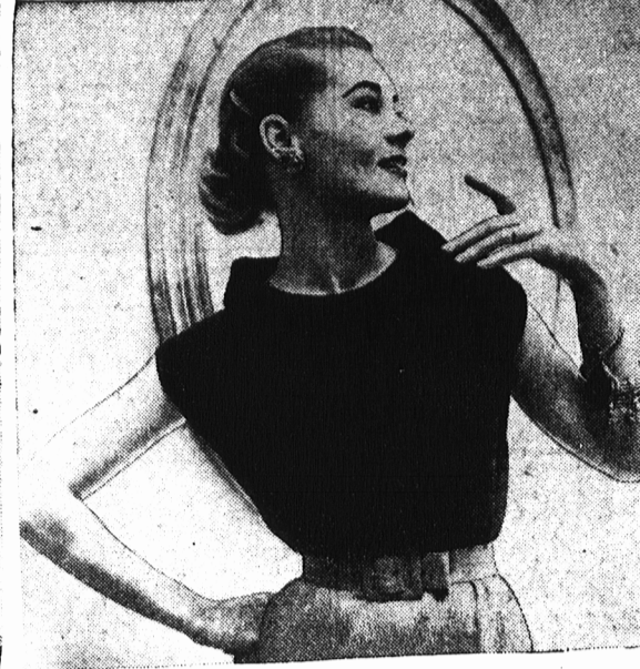
TURTLE-NECK POPULAR —A deep wide turnover collar is the chief feature of this fully-fashioned Cashmere sweater with cap

sleeves, popular this season in London. Comfortable and warm it is ideal for a dinner at home and comes in many shades.