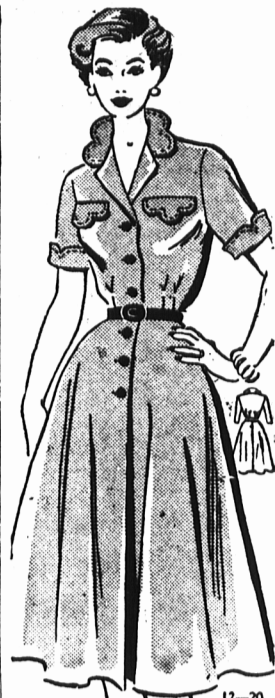
4736 by Anne Adams

Remove paper and sprinkle top with crumbled potato chips. (This topping to a pressure-cooked dish gives it a baked appearance.)