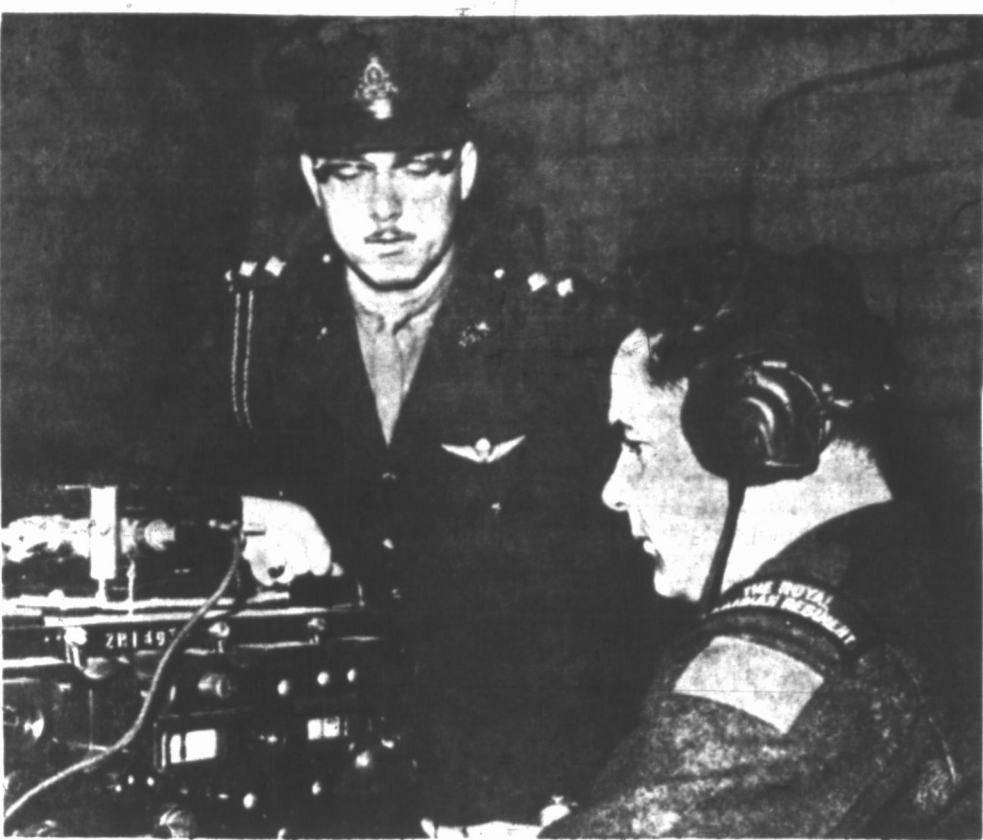
ISLAND MAN POSTED TO GERMANY