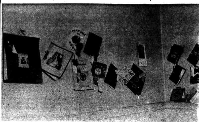
Display Of W. I. Programs

"It is not greatly to be wondered at that so much passenger traffic has gone to the Maritime Central Airways that the railroad has been left with very few passengers. "A good deal has been said by representatives of labour about the existence of hard times and unemployment. In a cold country like Canada, with a very heavy snowfall, it is difficult to have everybody working continuously. But I do not think it can be said that conditions are so bad when, according to returns, at the end of the 1954 deposits in our banks reached a total of $5,218 million, an in-