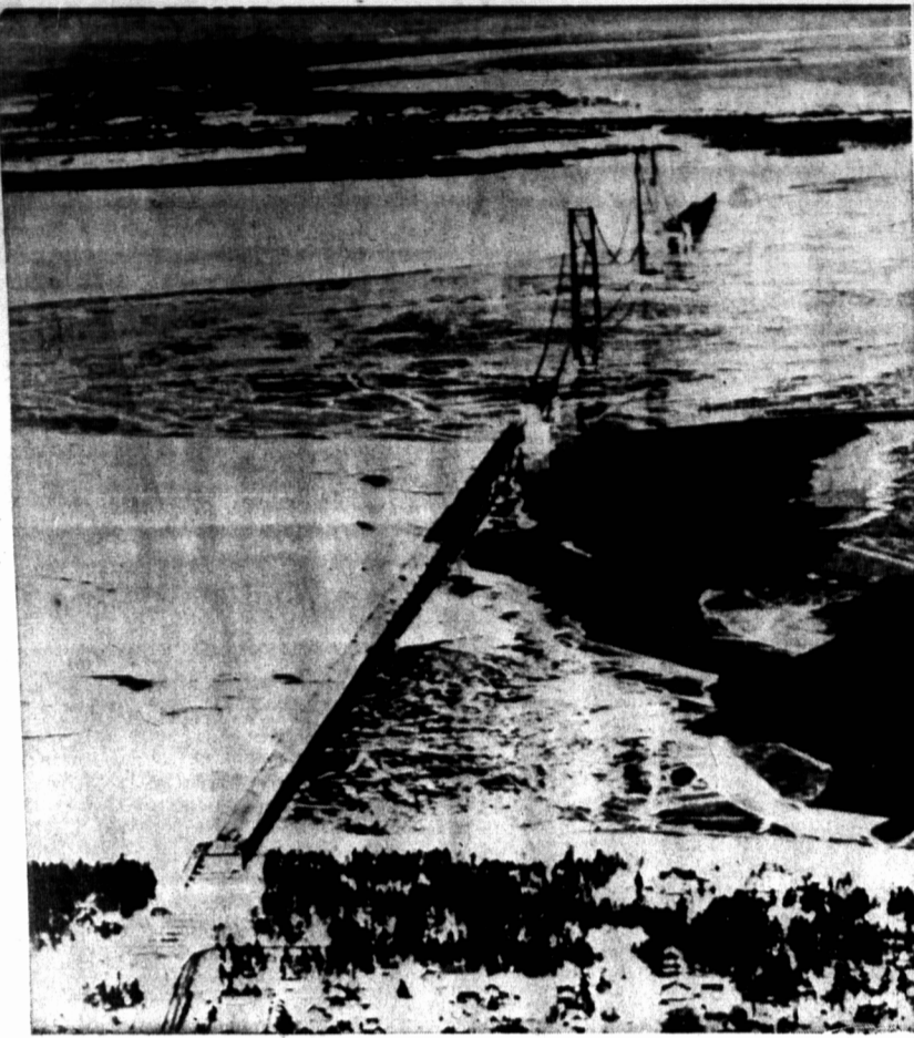
NEW BRIDGE ICEBOUND

The two-day convention of delegates represents about 45,000 French Canadians in the province. The resolution also asks that electors of a local Catholic public school district be granted the privilege of withdrawing from a public school division. The resolution will be presented later to the provincial government.