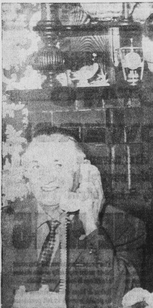
MAYOR YEO places the first official call from Montague to Charlottetown Deputy Mayor Walter Cox last evening to officially inaugurate the new telephone dialing system.