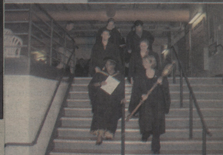
Nobody step on those robes