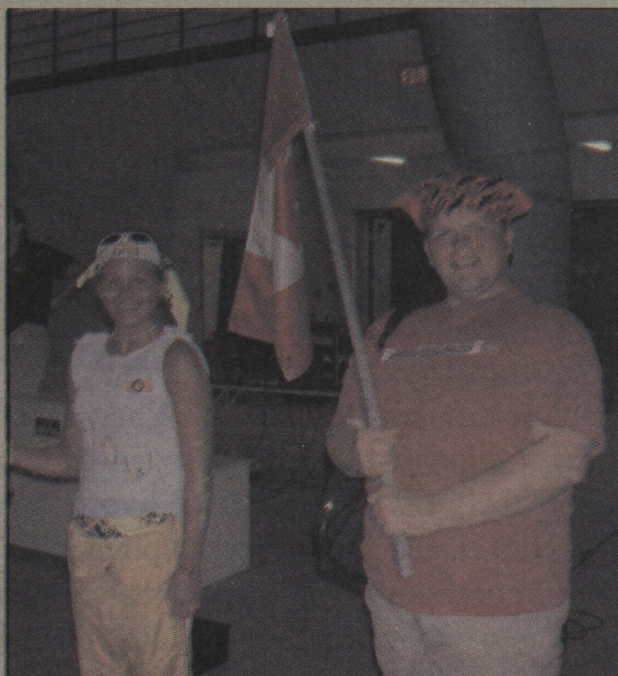
Fire and a Canadian Flag . . . what else does an Olympic event need?

NSO week was the Founder's Day ceremony, though this year an additional event was held on Saturday, the 11th to celebrate the 40th year of Shinerama with forty holes of mini-golf in an endeavour to push the collected money past $15,000 dollars. Response to the week's events has been for the most part positive. There are possible plans to make the many dozens of pictures taken during the week available for public viewing on the web, and any further information on that will be published in the near future.