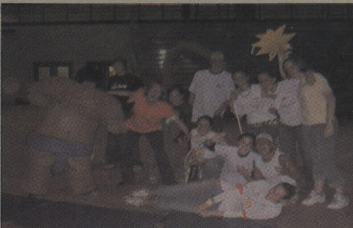
We don't need no water, let the mother . . . um . . . never mind

Thursday was also for classes, with the evening devoted to no less than three bands, two of which, The Contact and In-Flight Safety, gave strong, emotional performances that served as a set-up for party rockers The Trews. The final event of the traditional