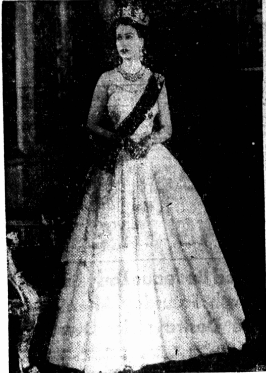
TODAY IS 4TH ANNIVERSARY OF ACCESSION