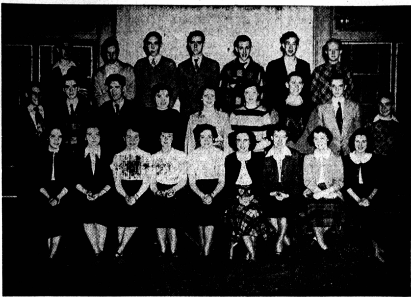
SECOND YEAR - SECTION IIA