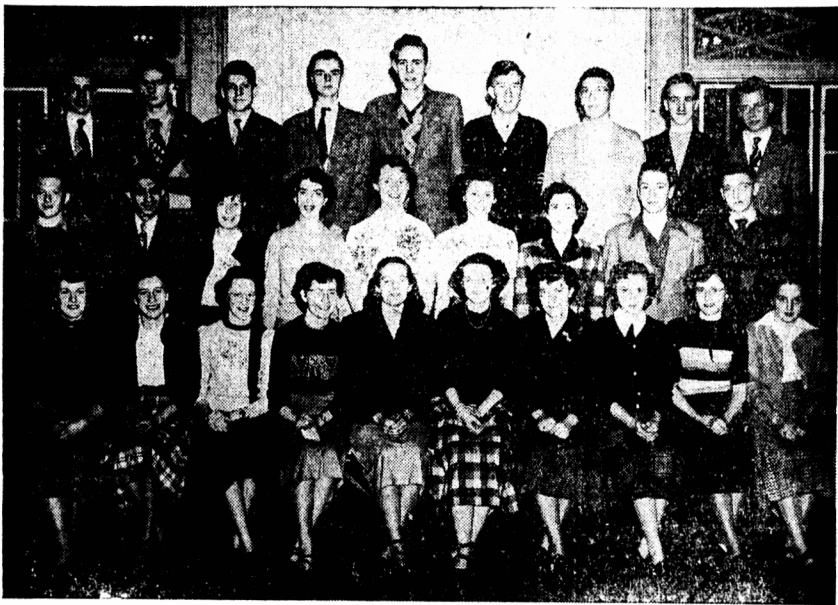
SECOND YEAR - SECTION IIB