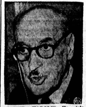
COUNT KAROLYI: He telegraphed his own purge.

Europe. Several diplomats recently attempted suicide. One found refuge in a mental institution and the Soviet M. V. D. is trying to repatriate him by force. Once a beehive of activity and anti-Western propaganda, the satellite embassies are today half-deserted, mysterious fortresses rigidly guarded by silent men of