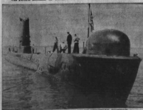
BRITISH SUB WAS CARNIVAL'S MOST UNUSUAL VISITOR