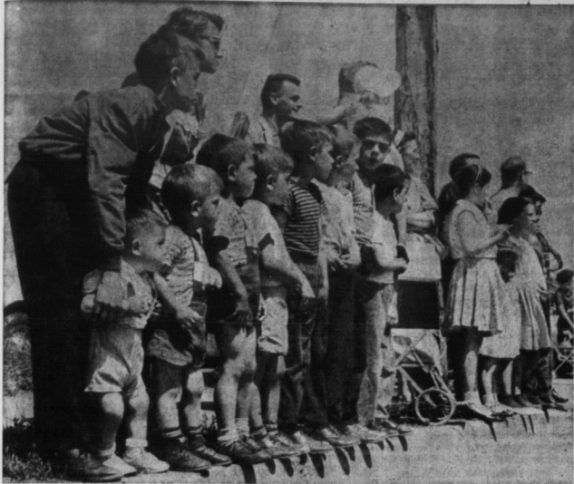
SO MUCH TO SEE! SMALL FRY TYPIFY THRO NGS WATCHING LOBSTER CARNIVAL PARADE