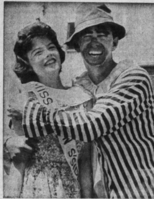
CLOWN HOLDS MISS P.E.I. CONTESTANT