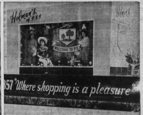
HOLMAN'S OF P.E.I. FLOAT TOOK TOP HONORS IN CLASS C1