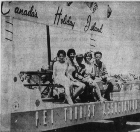
'HOLIDAY ISLE' THEME CAPTURED SUMMERSIDE THROUGH