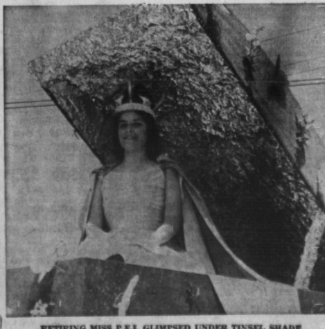
RETIRING MISS P.E.I. GLIMPSED UNDER TINSEL SHADE