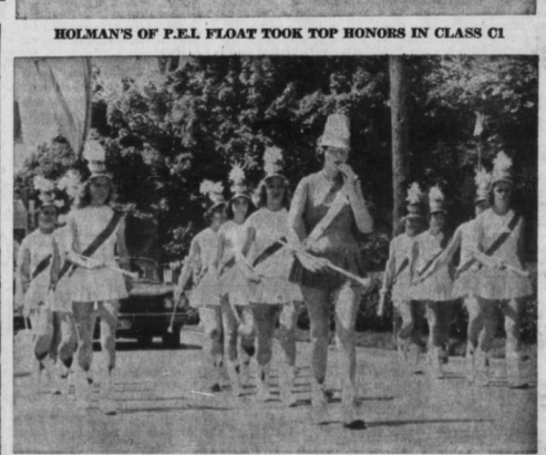
'SIDE MAJORETTES RANKED AS REAL EYE-CATCHERS