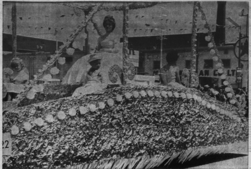
OVER-ALL TOP HONORS IN CARNIVAL PARADE WENT TO BO-KAY GARDENS WHICH ALSO HEADED CLASS C2