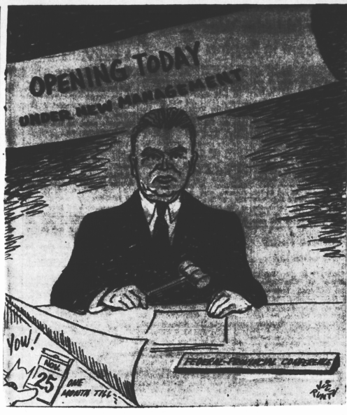
"WELL, GENTLEMEN" — — —

Sir Winston Churchill's achievements are proof of his greatness. It is pleasant to note, however, that Field Marshal Viscount Montgomery deprecates the uncompromising remarks about him which have appeared in a number of recent books written by men who worked with him during the war.