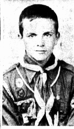
Off For Jamboree