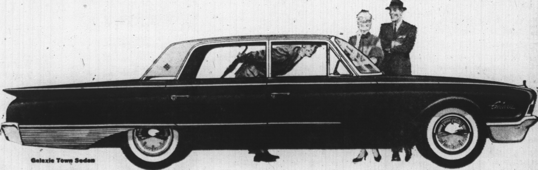
SIX or V-8

A Wonderful New World of Value—Savings include up to 4,000 miles between oil changes, and aluminized mufflers with up to twice the ordinary life. Add a choice of V-8's or economical Six and you can be sure that, without a doubt, the 1960 Fords are truly the Finest Fords of a Lifetime!