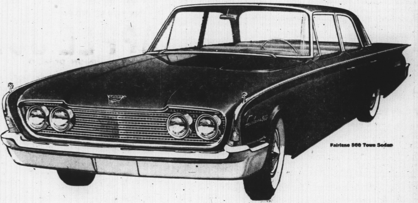
Fairlane 500 Town Sedan