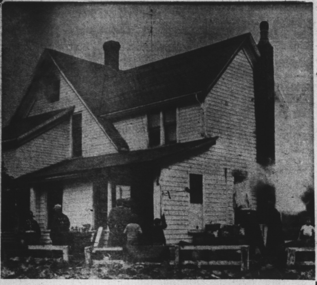
FIREMEN STRIVE manfully to bring a sudden outbreak of fire under control at Summerside yesterday.