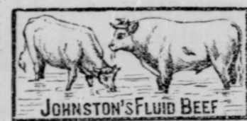
JOHNSTON'S FLUID BEEF