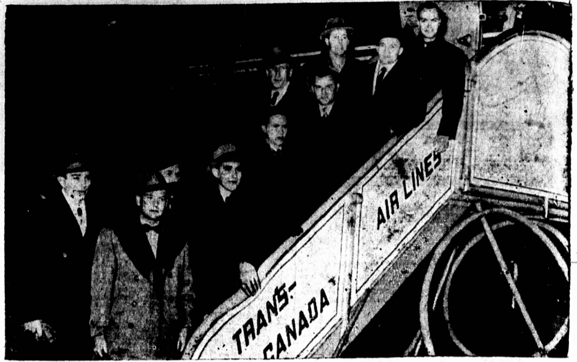
Federal government veterinarians and-mouth disease which is causing losses of hundreds of thousands of dollars to Canada's livestock farmers and threatening to spread disease but hope to stop it from causing millions more. They admit they know of no sure cure for the