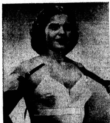
Snip go the straps! See how all the up-lift continues... even after the straps have been cut. Gothic's exclusive Cordtex inserts are the answer!