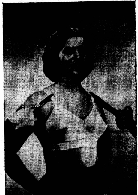
This pretty Montreal housewife and mother, age 26, models her favorite Gothic Bra. Remember, there's a Gothic style to flatter every figure.

Actual photostory + proves you'll be more comfortable in a Gothic Bra!