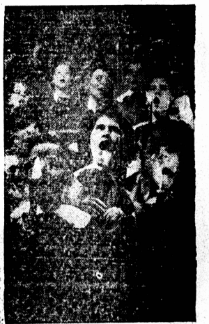
HERALD ANGELS . . . Rehearsing for the annual Christmas candlelight service, the children choristers of the Crawford Methodist Memorial church in the Bronx, New York, make an impressive picture when viewed through a Christmas wreath in the foreground.

So much elegance made the popularity of white gloves and long gloves—16-button length — a foregone conclusion. Many of the new dresses and even coats have three-quarter or bracelet length sleeves. With these long gloves, wrinkled at the wrist are a practical necessity. They also are shown over the full length, tightly fitted sleeve. Many of the strapless evening gowns from whose bodice and jutting necklines shoulders and arms emerge very naked indeed, have special gloves made of the same material as the gown or some deliberate contrast, reaching to the shoulders and ending in a flared cuff. Gloves are satisfying Christmas gifts.