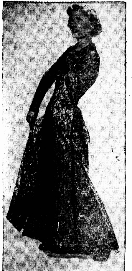
Black lace combined with white satin in a Parisian negligee with lush back-interest. Imported nylon lace by Marie France.

Along with short hair, the day-length formal gown is firmly established in winter popularity. Very décolleté, and often equipped