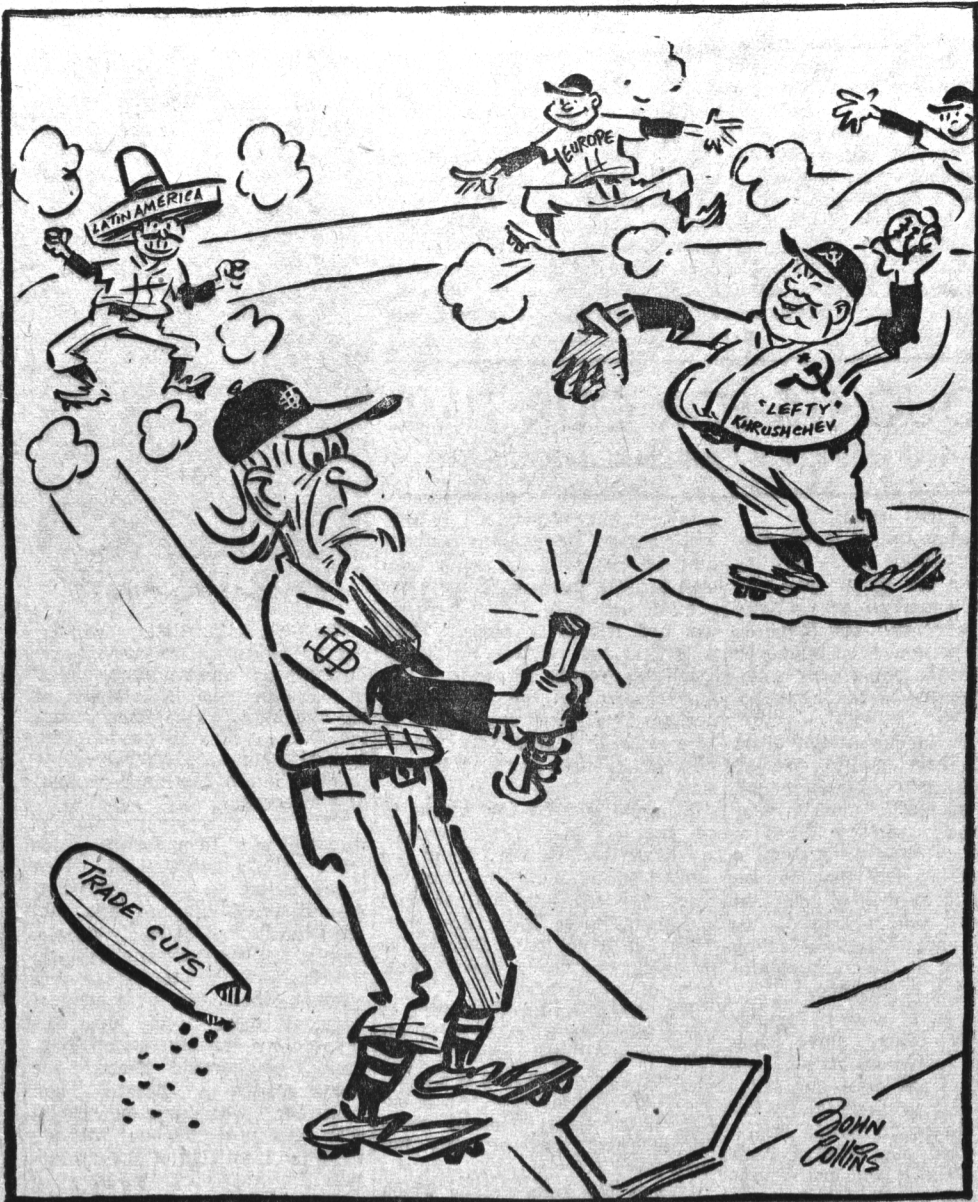
WITH THE BASES LOADED TOO

A report from White Bay on Newfoundland's Northeast coast says that the water is "teeming with turbot," for which there is an excellent market, but that there is no bait available to fishermen.