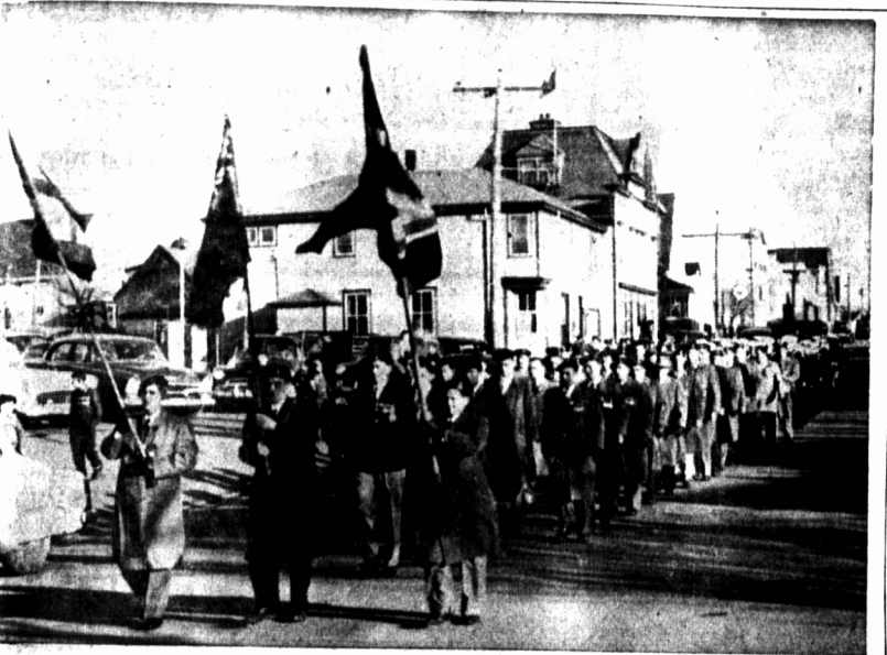
AT SOURIS, PARADE LEAVING ST. MARY'S HALL.