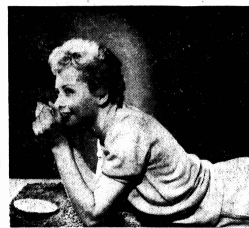
TEENS 'N TWENTIES TAKE TO TEA —A cup of Tea works wonders when they're tired and it's so relaxing.