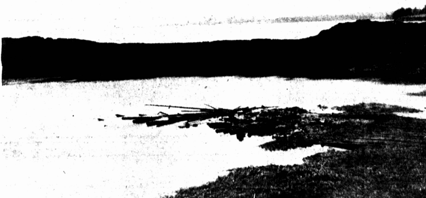
The causeway as viewed from North River Bridge.