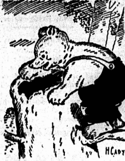
Buster Bear climbed up until he could look down into the top.

Buster Bear reached down in the hollow with a long arm. He couldn't touch Unc' Billy Possum. But he could get those big claws of his near enough to Unc' Billy to make him shiver and wish he were somewhere else. "I'll get you," growled Buster Bear. "No suh, Brer Bear, yo' done make a mistake. This ol' Possum isn't ready fo' a dinner yet," said Unc' Billy. He began to dig in the soft decayed wood under him. It was easy digging. In no time at