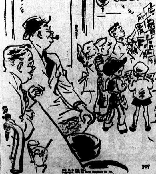
"That comic book stand does bring in customers—to hang around and read 'em."