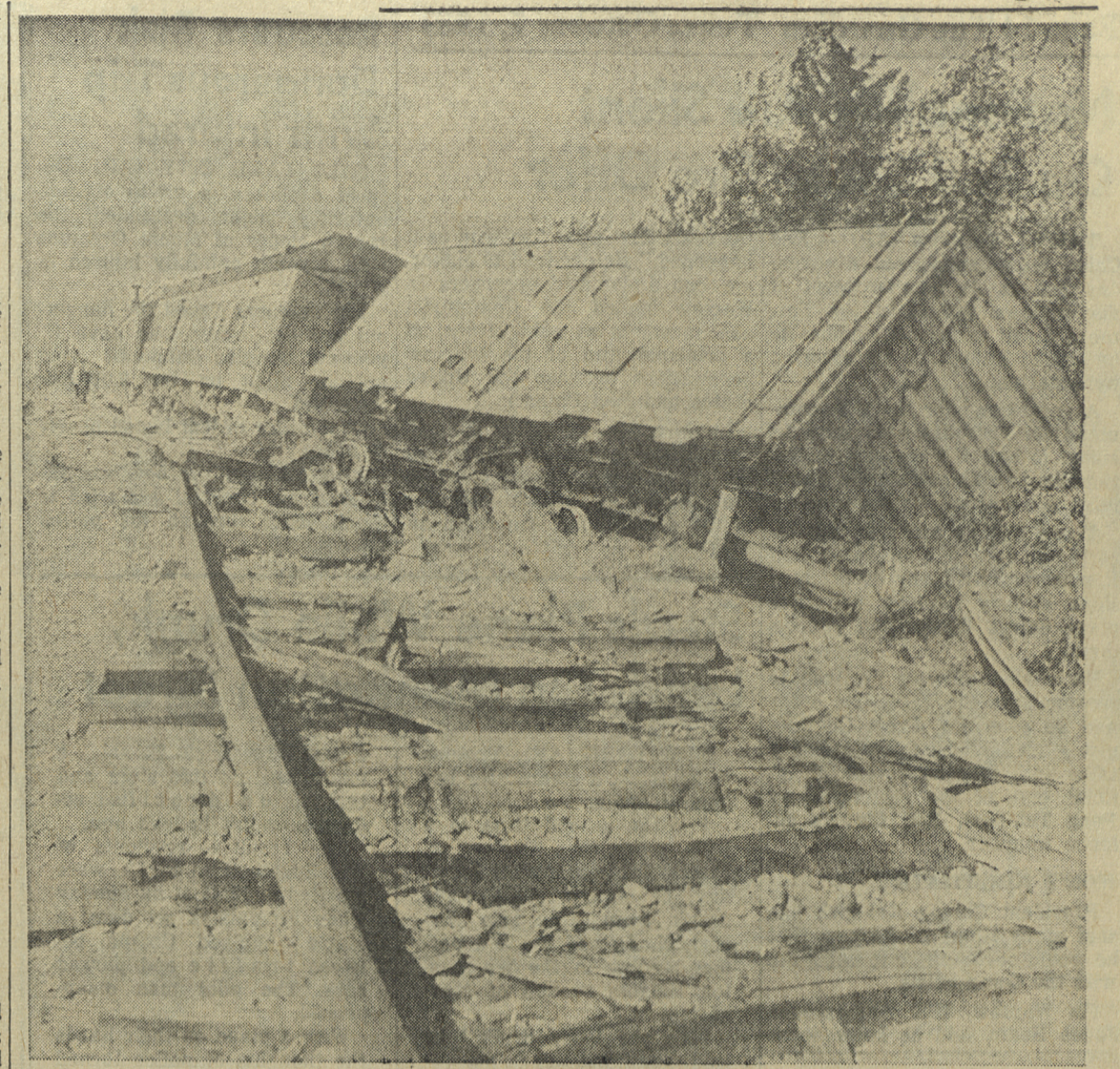
SOME OF THE derailed cars and the torn up track. This picture was taken from the engine caboose.

Four of the 150-yard distance ties and rails were completely demolished and strewn