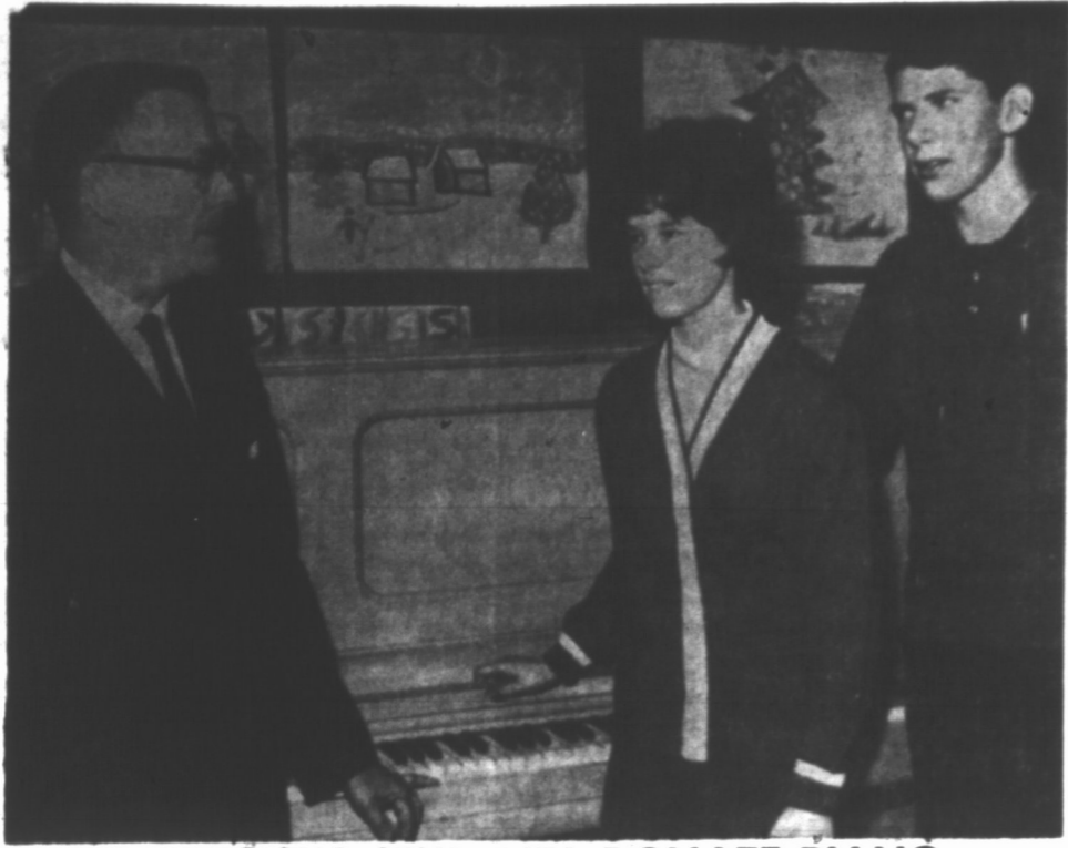
QCHS STUDENTS DONATE PIANO