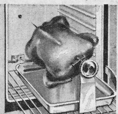
NEW ROTISSERIE NEVER GETS OFF BALANCE

Melts butter instantly, starts bacon sizzling in seconds. Delivers extra heat for fast pre-heating, then automatically holds preset temperature.