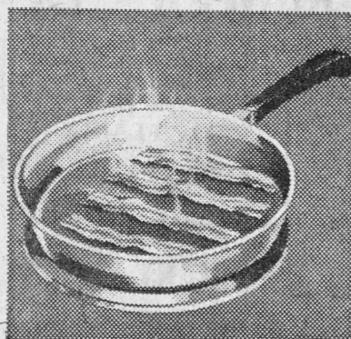
SPEED-HEAT UNIT HEATS UP F.A.S.T.

Thick juicy steak broiled to succulent goodness in FRIGIDAIRE'S new spatter-free broiler grill