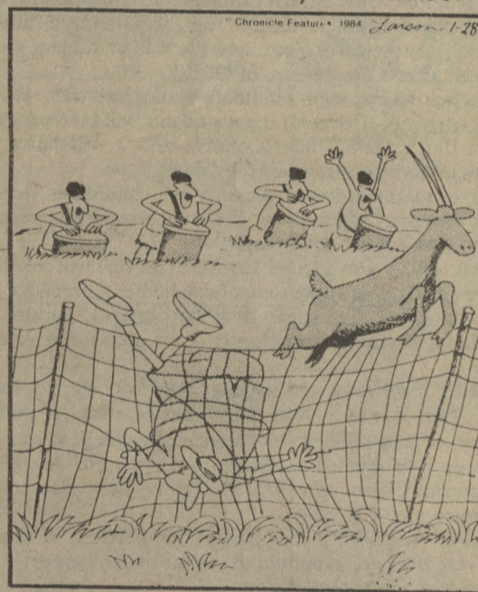
Confused by the loud drums, Roy is flushed into the net.