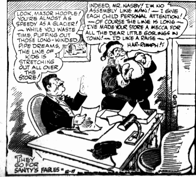
THEY GO FOR SANTY'S FABLES - 12-17