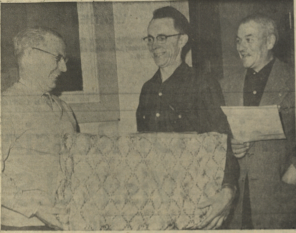
PRESENTATION MADE CNR EMPLOYEE