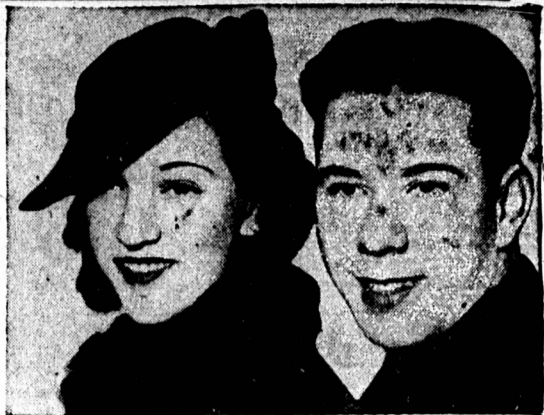
FATHER OF TWO GAVE HIS LIFE TO SAVE YOUTH