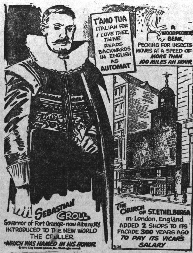
SEBASTIAN GROLL Governor of Fort Orange—now Albany, N.Y. INTRODUCED TO THE NEW WORLD THE CRULLER WHICH WAS NAMED IN HIS HONOR

CFCY TV CHANNEL 13 WEDNESDAY 4:30 p.m.—Afternoon Musicals 5:00 p.m.—Hobby Corner 5:15 p.m.—Rope Around The Sun 6:00 p.m.—Rin Tin Tin 6:00 p.m.—Western Theatre 6:54 p.m.—CFCY TV News 7:01 p.m.—Gazette 7:30 p.m.—Mv Little Margie 8:00 p.m.—TBA 8:30 p.m.—Disneyland 9:30 p.m.—Boyd Q. C. 10:00 p.m.—Kraft Mystery Theatre 11:00 p.m.—Closeup 12:00 p.m.—CBC TV News 12:13 a.m.—Local Weather Forecast 12:15 a.m.—Viewpoint 12:22 a.m.—Sign Off