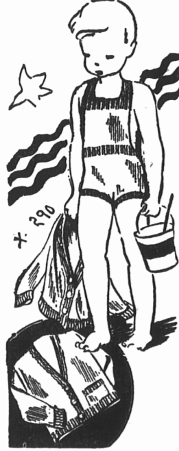
DESIGN NO. X 290

Here is an ideal hand knitted ensemble for the two and three year old boy or girl. It is a combination bathing and sun suit, with a matching cardigan. Pattern No. X 290 contains large illustration complete instructions and materials needed.