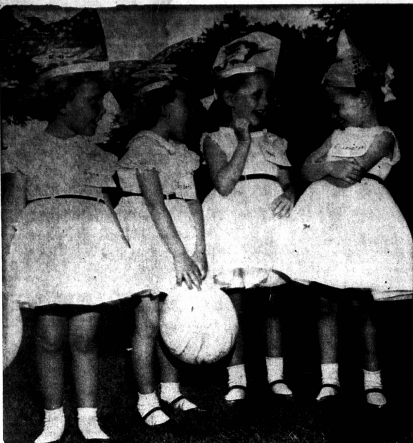
"AND ABOUT THAT WOMAN NEXT DOOR"

A nice assortment of vacation and casual clothes and separates are in the stores right now ready for plucking. Here we have a two-piece dress, with matching beach shorts underneath, done in three shades of either blue, green or rose. The blouse could go nicely with other skirts of course, as could the skirt with other blouses. The skirt is gathered onto its own belted waistline. Nice for backyard wear, too.