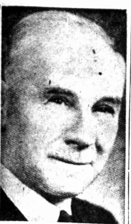
DR. N.L. BOWEN Was Well Known In This Province